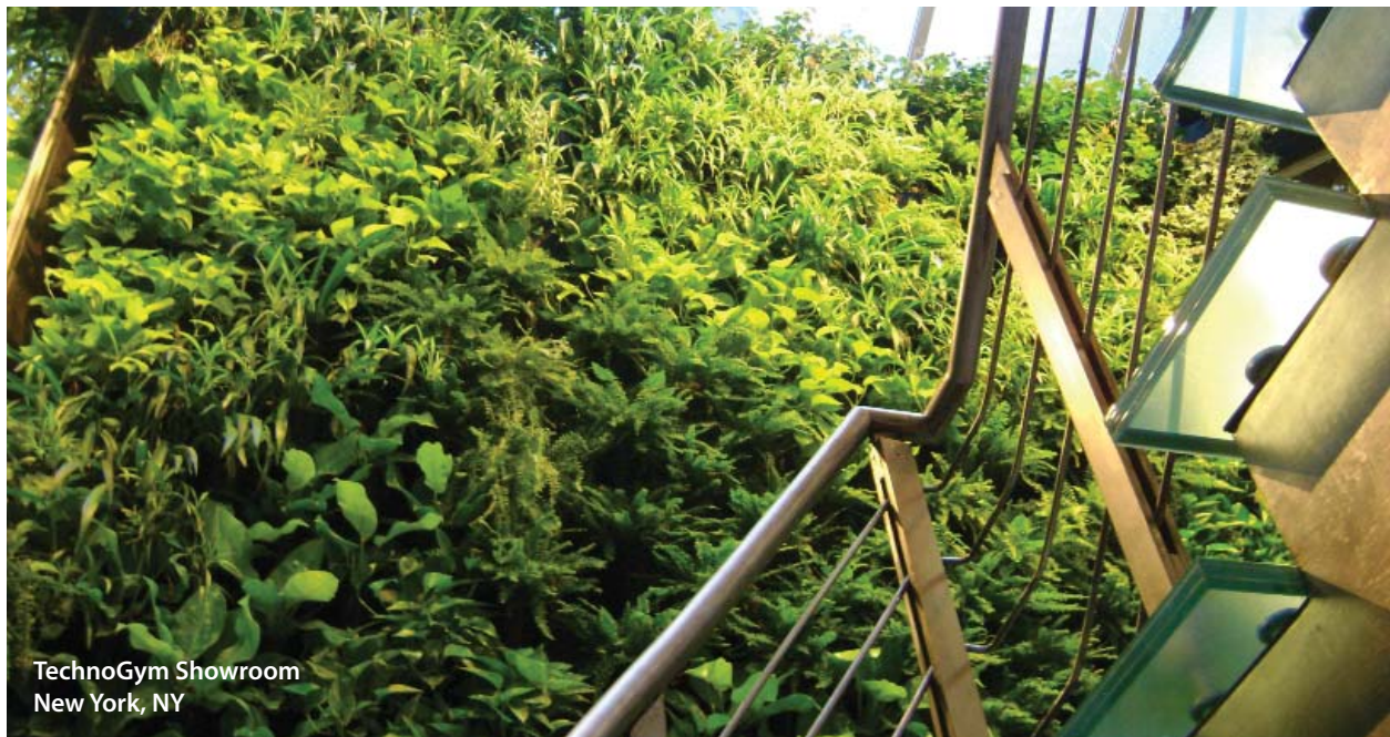
TechnoGym Showroom New York, NY

We recognize that styles change and spaces evolve. TerraScreen® offer more flexibility than any other green wall system; designed so that the planting may be easily updated so the installation is appropriate to the style, season, and environment.